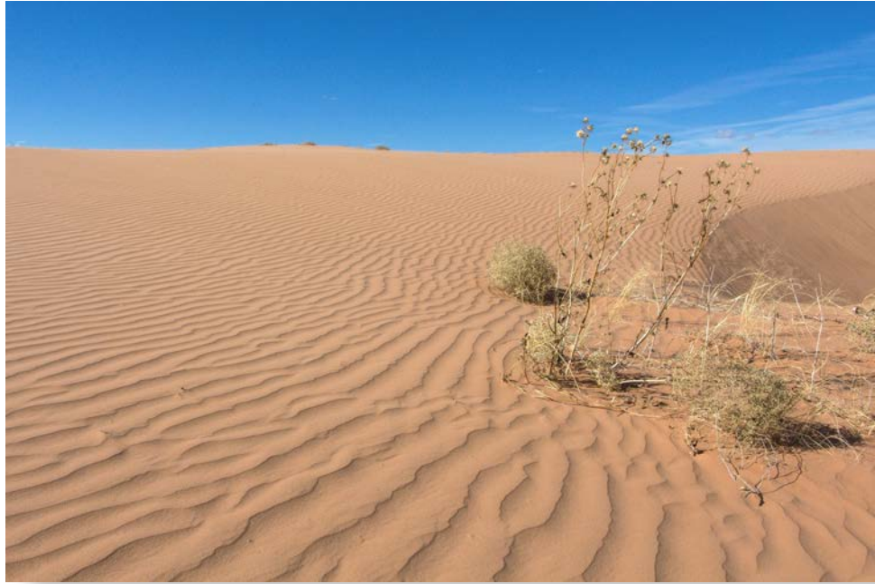
Waves of Sand