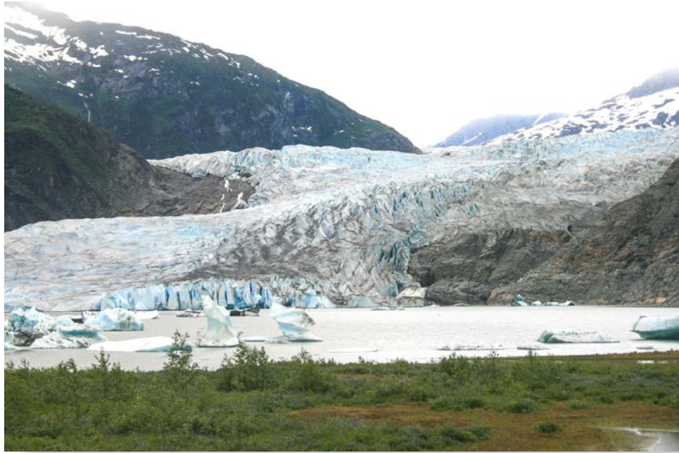
Glacier on the Move