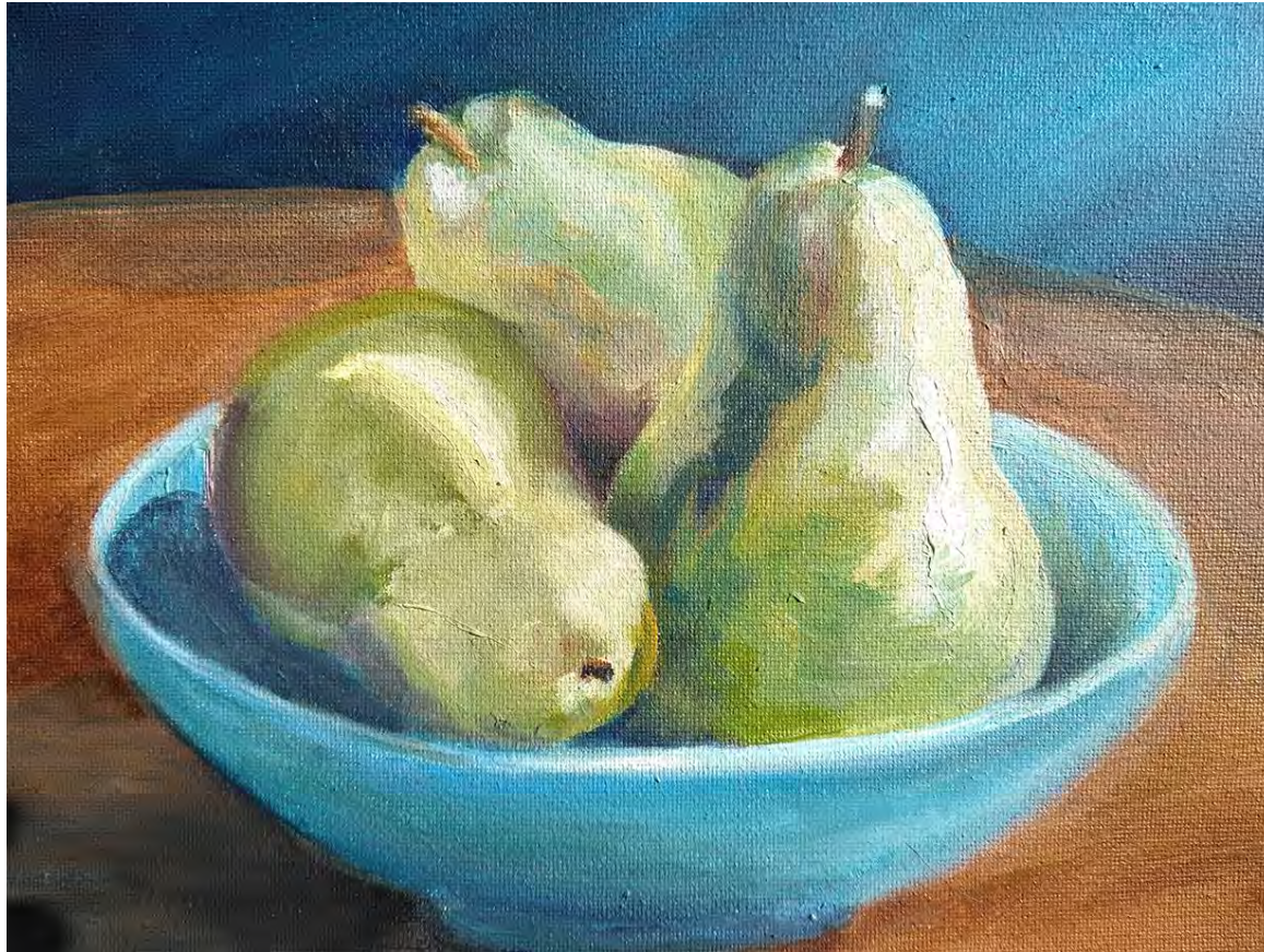
Trio of Pears