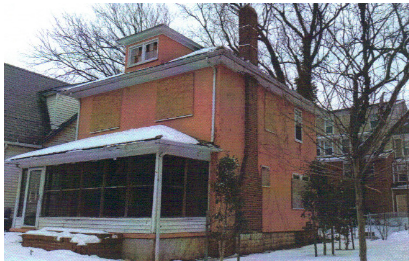
123 Clay Street, Annapolis

If you are interested in contributing or working on this project, please contact Pat Fleearty ( pfleearty@hotmail.com ).