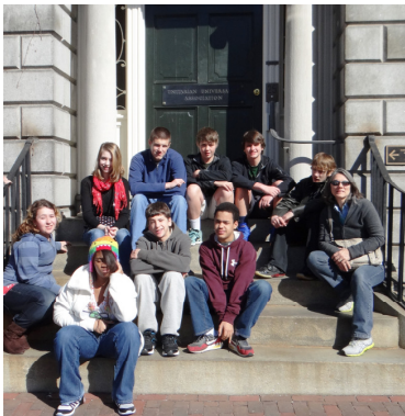
COA visits UUA on Beacon St.

Many UU activities were included in the overflowing itinerary. Along with the customary visits to UUA, the UUSC, and a UU Divinity student-led walking tour of UU churches, the UU highlights included playing the pipe organ and the steeple bells at the Arlington Street Church and a service led by the Divinity students at Harvard. IN addition, this COA group will be the last to visit the UUA at Beacon Street; next year's group will visit the new location at 24 Farnsworth in the Innovation District.