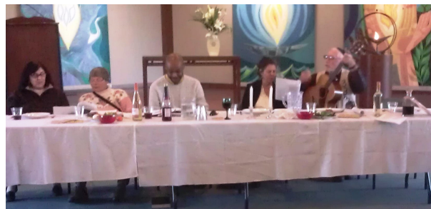
Enjoying the Seder meal.