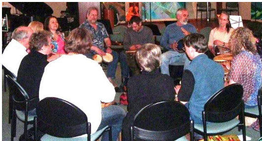
Drum Circle performing at Cabaret Night.